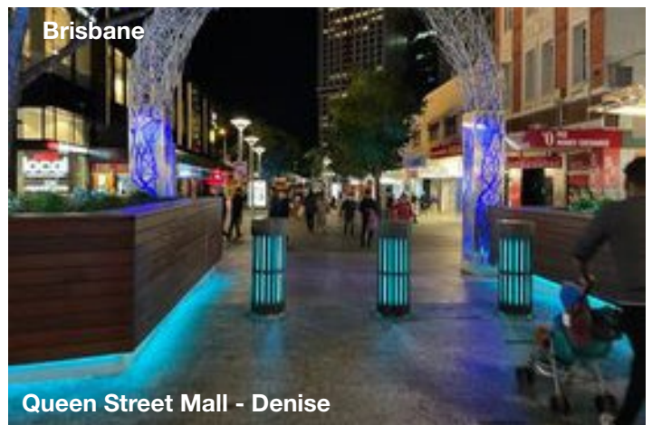
Queen Street Mall - Denise