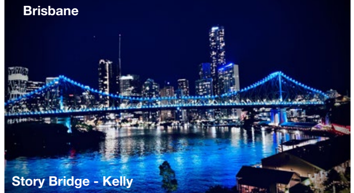
Story Bridge - Kelly