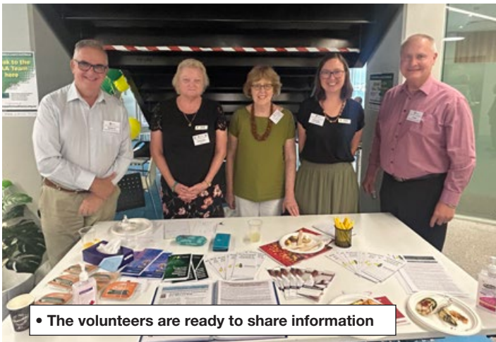
• The volunteers are ready to share information